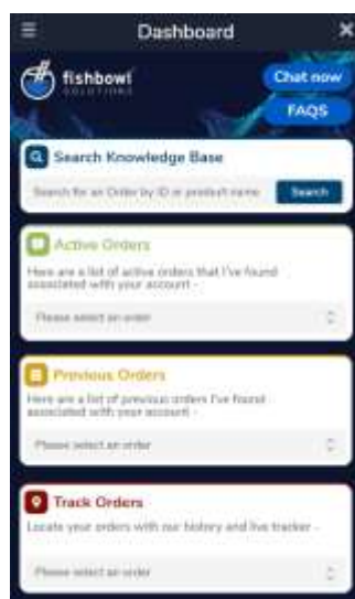
Figure 3: Dashboard view.