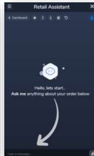
Figure 2: Free chat initiation.